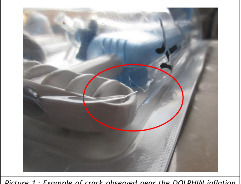
<u> Picture 1 </u>: Example of crack observed near the DOLPHIN inflation device handle