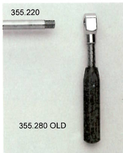
Handle, flexible (355.280) old: