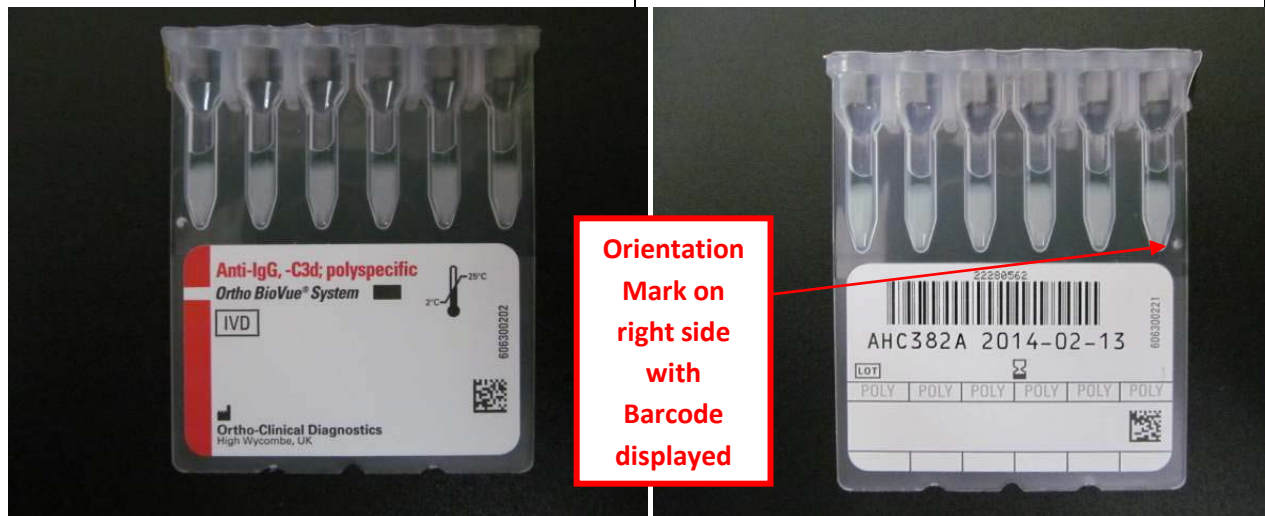
(Back View - Figure 2b)