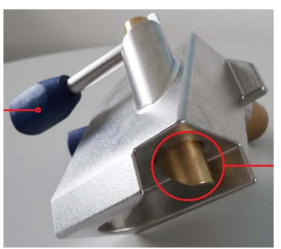
Figure 2: Incorrectly mounted latch