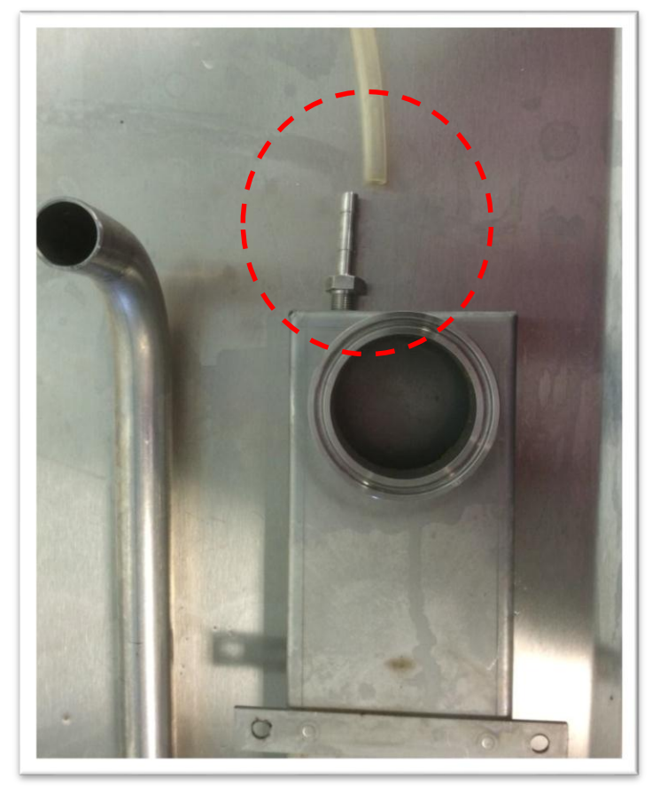
Figure 1: vent hole added on top of manifold to prevent trapping of air.

Appendix 1: Photos of ventilation hole eliminating any trapped air in the manifold..