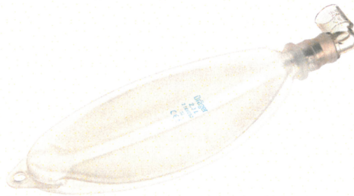
Test lung with silicone breathing bag

Dräger is currently working on improved labelling on the products. Latex breathing bags with improved labelling should be available from May 2014. The test lung with part number 8403201 and the breathing bags in the reusable anaesthesia sets with part numbers M33681 and M27542 have been switched to the latex-free version made of silicone.