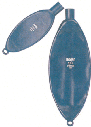
Breathing bag made of natural rubber (latex)