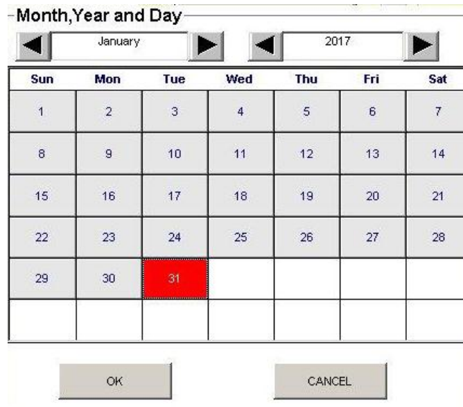
Figure 3. Pop-Up Expiration Date Calendar