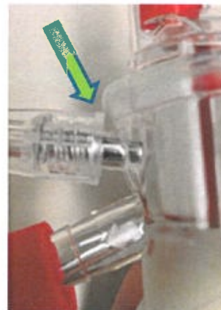
Fig. 2 (correct position of the temperature probe)

We apologize for any inconvenience this may cause. If you have questions or require additional information, please contact your local MAQUET representative or MAQUET Customer Service.