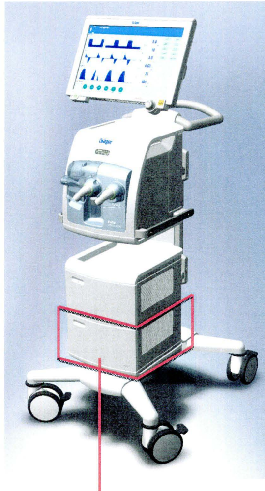
optional PS500 - Power supply unit