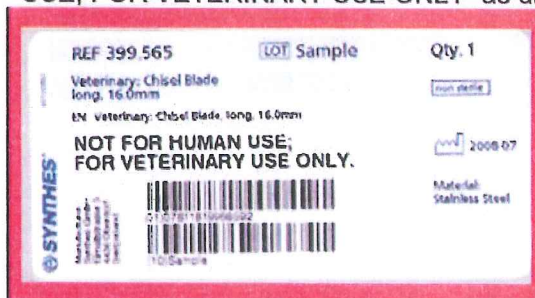
Figure 1 - Incorrect Label for Part Number 399.565

The incorrect label was applied to the product that is the subject of this action. Certain lots of the Chisel Blades that were shipped to your facility may be labeled as "NOT FOR HUMAN USE; FOR VETERINARY USE ONLY" as displayed in Figure 1.