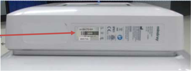
Figure 3 Main Unit Label