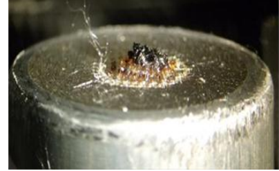
Figure 3: Failed Pad Melt has occurred. Do not use. Replace pad.