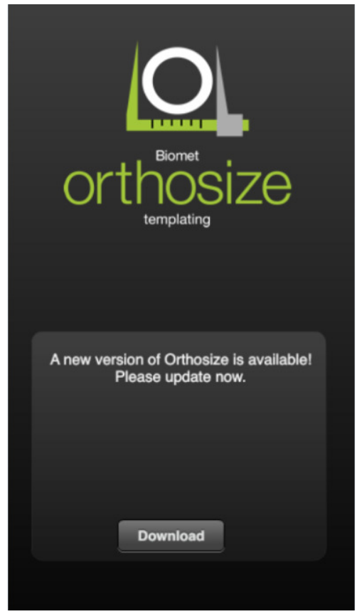
Figure 3 Orthosize Update Screen

Our records indicate you are an Orthosize<sup>®</sup> Templating user. In approximately 6 weeks you will receive a notice that an update is available for the Orthosize<sup>®</sup> Templating App. Upon selecting the app the screen seen in Figure 3 below, will be displayed requiring you to update the app in order to use it.