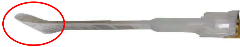
Incorrectly applied label