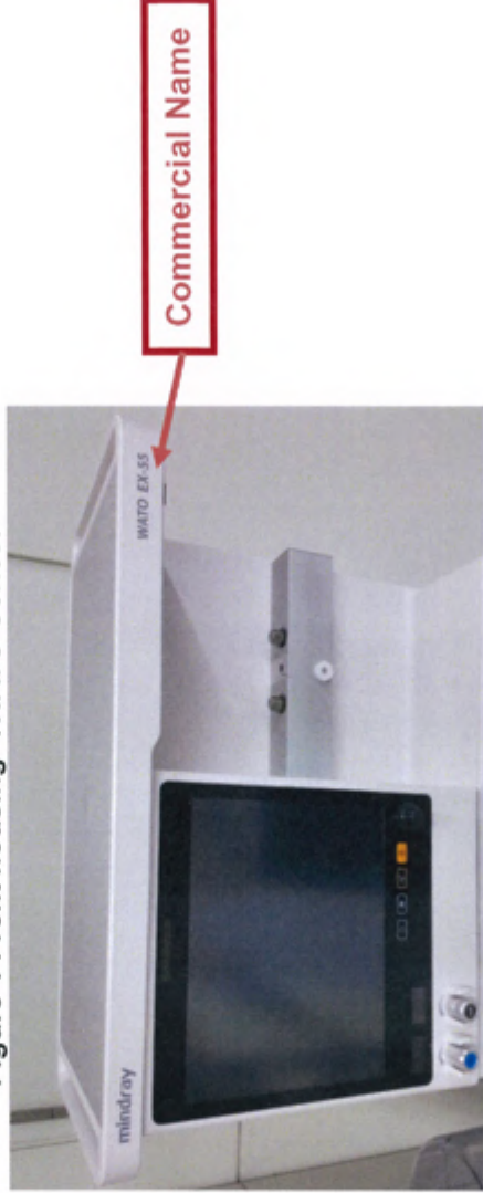
Figure 1 Front housing (WATO-Series)

The commercial name is on the front housing, the serial number is on the main unit label which is on the back of the device. If you do not know how to identify the machine serial number, please refer to below picture: