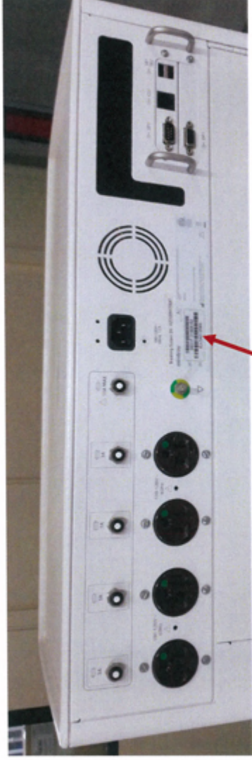
Figure 4 Main Unit Label (A-Series)