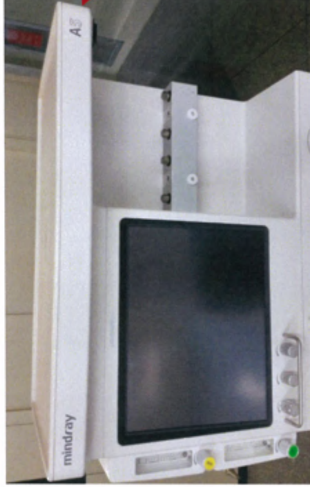
Figure 3 Front housing (WATO-Series)