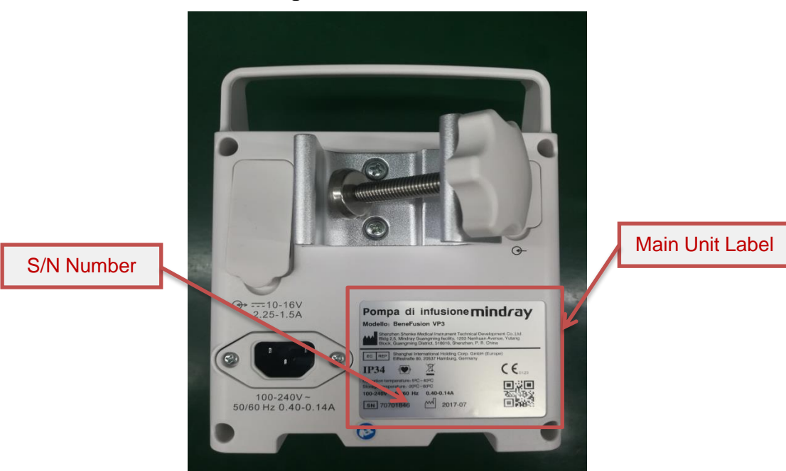
Figure 1 Main Unit Label

The serial number is on the main unit label which is on the back of the device. If you do not know how to identify the machine serial number, please refer to below picture: