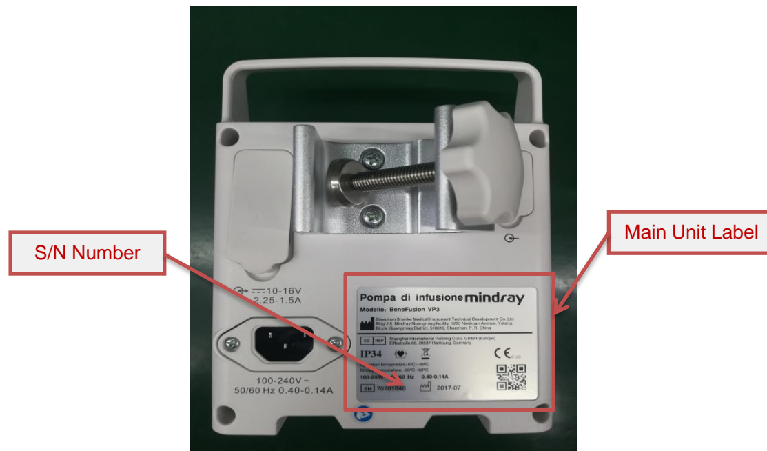
Figure 1 Main Unit Label

The serial number is on the main unit label which is on the back of the device. If you do not know how to identify the machine serial number, please refer to below picture: