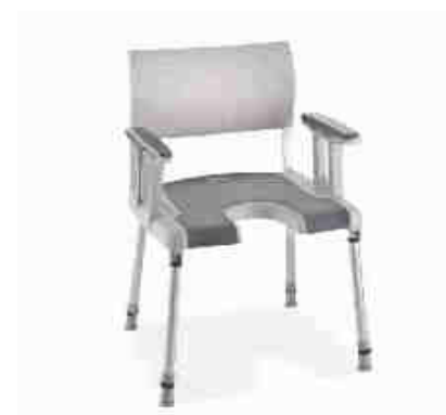
Current design (after June 2016)