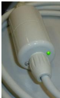
Figure 1 Green LED indication of function

Page 2 to the letter of March 18, 2019 TO WHOM IT MAY CONCERN