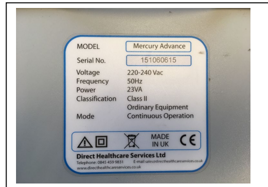
Figure 2: On-product label showing format of serial number on the Mercury Advance V1

Please note that this Field Safety Notice DOES NOT in any way relate to the Mercury Advance V2 control unit manufactured and sold since 2015 and identified as follows: