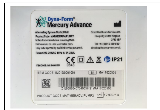
Figure 2: On-product label showing format of serial number on the Mercury Advance V2

Date: 15 March 2019 Attention: All Customers and End-users Reason: In response to a Potential Concern reported to the MHRA under reference number MHRA AI 2018-010-010-206-001