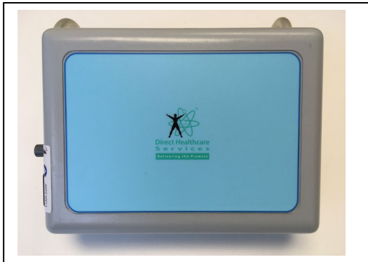
Figure 1: Front panel showing artwork on the Mercury Advance V1

Affected Devices: Mercury Advance V1 control units manufactured and sold between 2011 and 2015 and identified as follows: