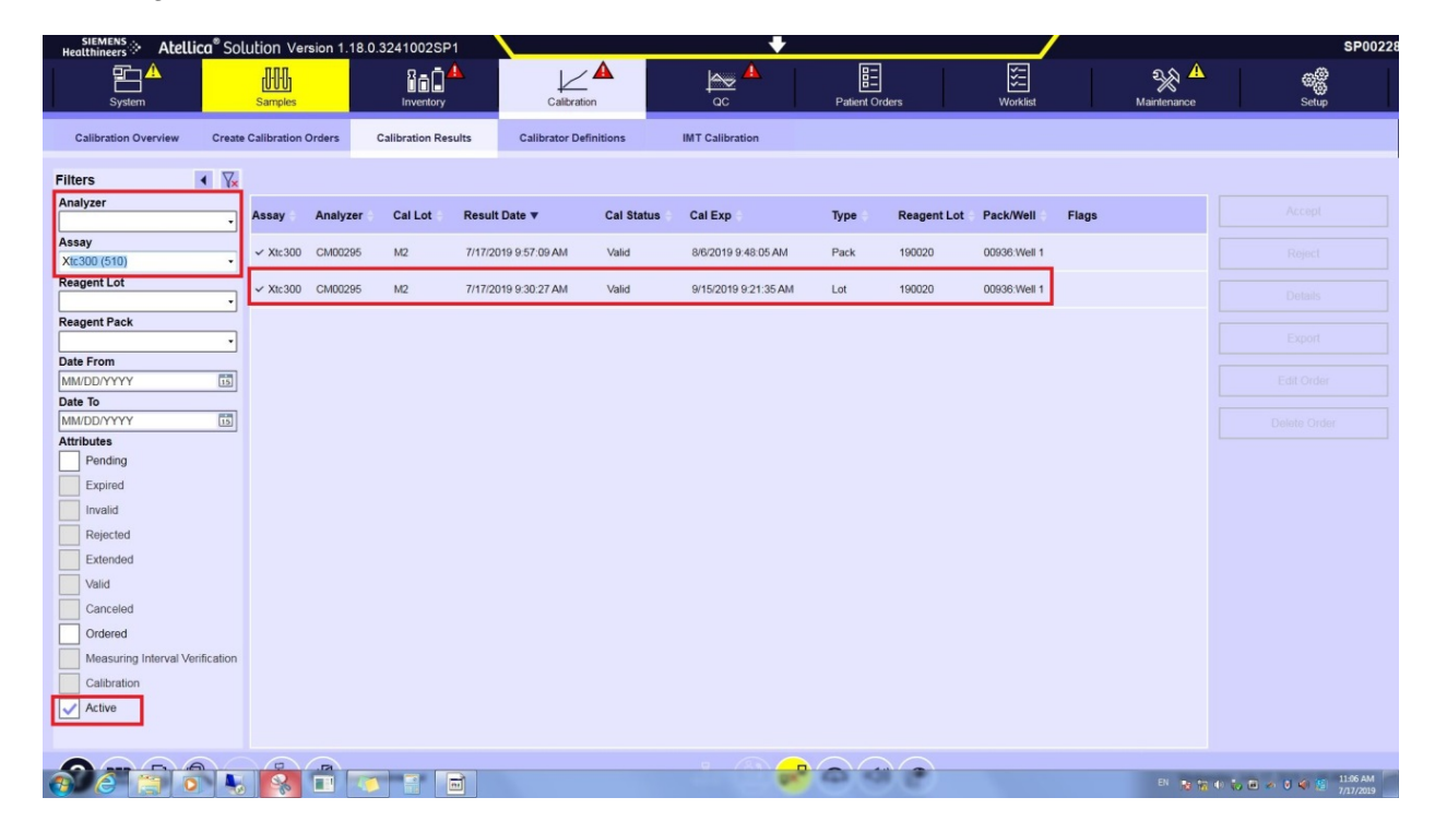
Figure 1. Calibration Results Screen

calibration must be performed. This process must be repeated until the well test count reaches zero.