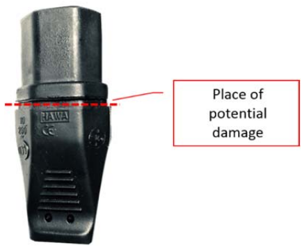
Figure 1 Place of potential damage

We would like to point out that the affected power cords are still fully compliant with the requirements of all applicable electrical and medical device standards.