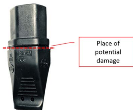
Figure 1 Place of potential damage

We would like to point out that the affected power cords are still fully compliant with the requirements of all applicable electrical and medical device standards.