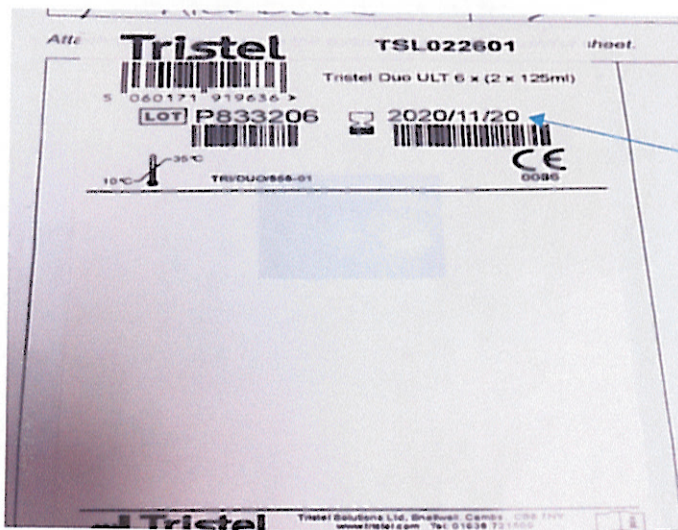
Fig 1. Correct in transit label expiry date