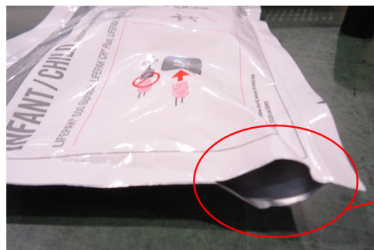
Affected area of pouch unsealed