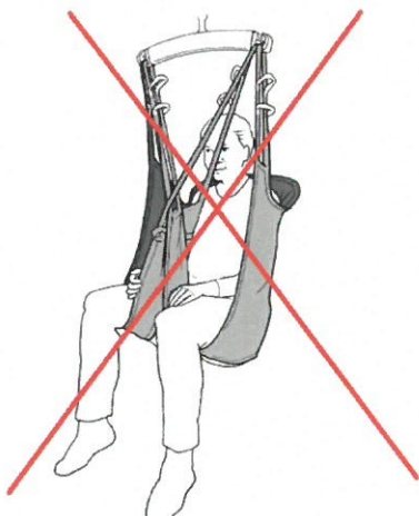
The improper illustration Incorrect use of the sling

Hygiene slings have a large opening for the buttocks, which is associated with a risk of slipping. Therefore, it is important that the end-user has his/her arms outside the sling, in order to prevent any slipping from the sling.