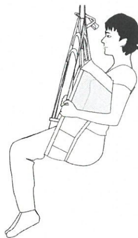
The correct illustration Correct use of the sling