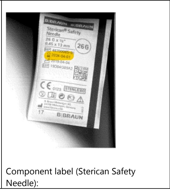
Component label (Sterican Safety Needle):