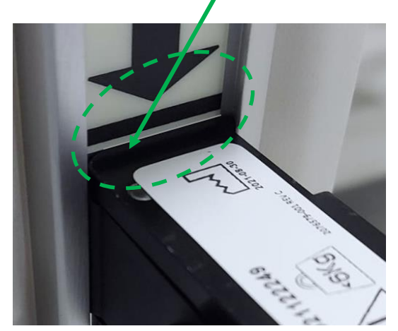
Fig 4 Correct installation (full contact with no gap) of the dovetail mount with the dovetail rail

No Gap between the dovetail mount and the rail