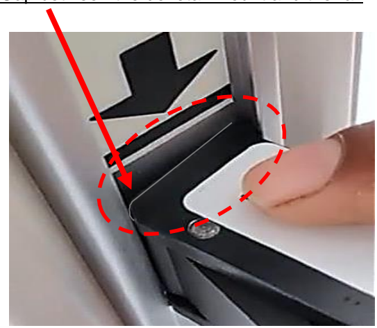
Fig 3 Incorrect installation due to defective dovetail mount accessory (gap or opening presence)

Gap between the dovetail mount and the rail