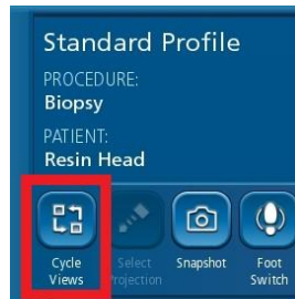
Cycle Views icon that can be used to refresh the Guidance View if this anomaly is observed. Restoring accuracy to the Biopsy Depth Gauge.

If system navigation seems inaccurate and steps to restore accuracy are unsuccessful, abort use of the system.