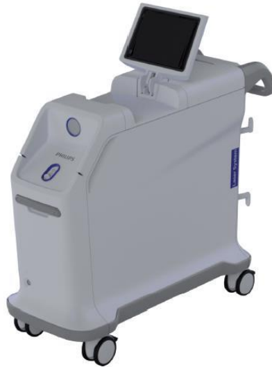
Figure 2: LAS-100 Philips Laser System

As an alternative treatment, the CVX-300 Excimer Laser System, which is clinically equivalent to the LAS-100 Philips Laser System, can be used, if available, for peripheral and coronary atherectomy and lead extraction as per the Instructions for Use of the laser catheters.