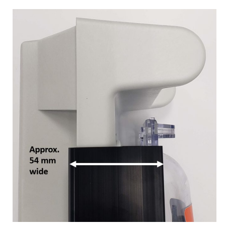
Figure 2: Wide Hinge Width 54mm (Affected Chambers)