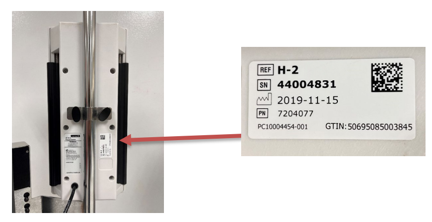
Figure 1: Location of Serial Number on H-2 Pressure Chamber