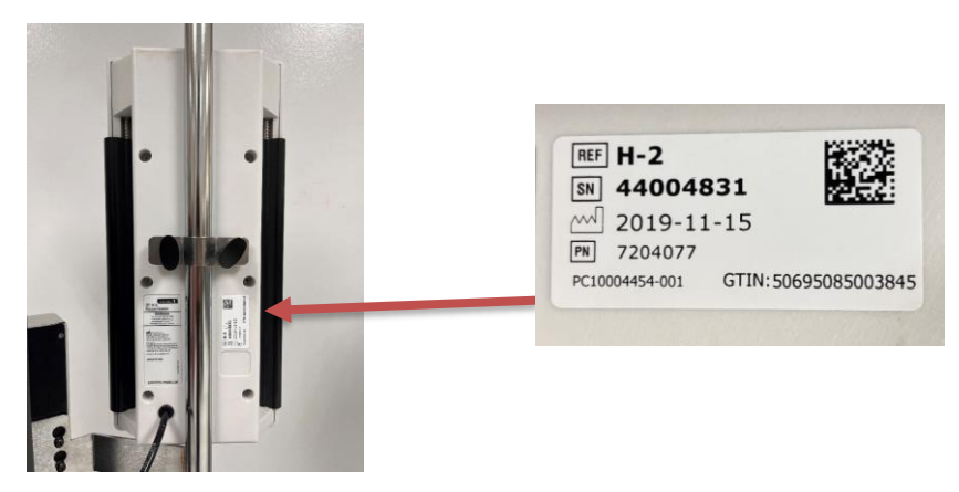
Figure 1: Location of Serial Number on H-2 Pressure Chamber