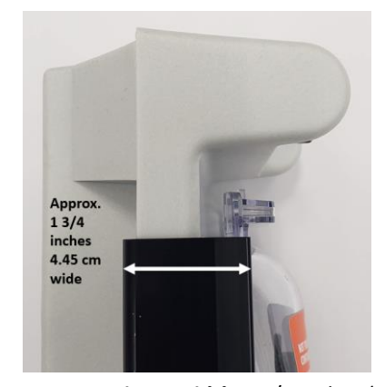
Figure 3: Narrow Hinge Width 1-3/4 inches (4.45 cm) (Non-Affected Chambers)

2. If the device has the narrower hinge assembly as in Figure 3, then it is not affected, and you can continue to use the device per the Operator's Manual and IFUs.