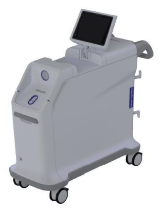
Figure 3: LAS-100 Philips Laser System

The LAS-100 Philips Laser System (see Figure 3) is used in minimally invasive interventional procedures within the cardiovascular system, and for the removal of pacemaker and defibrillator cardiac leads.