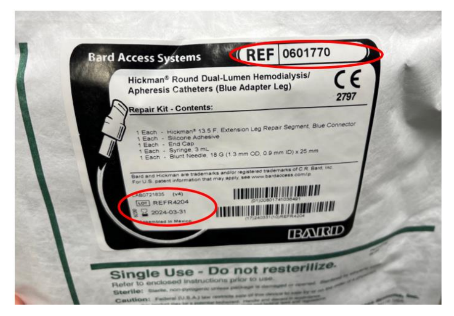
Figure 2: Pouch product code, lot number and expiry date identification