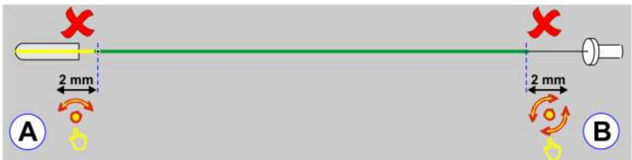
Figure 3. Scenarios A & B in which the use of the Catheter Bending functionality can lead to the introduction of a reconstruction error.

Figure 3 shows an illustration of scenario A and B as described above.