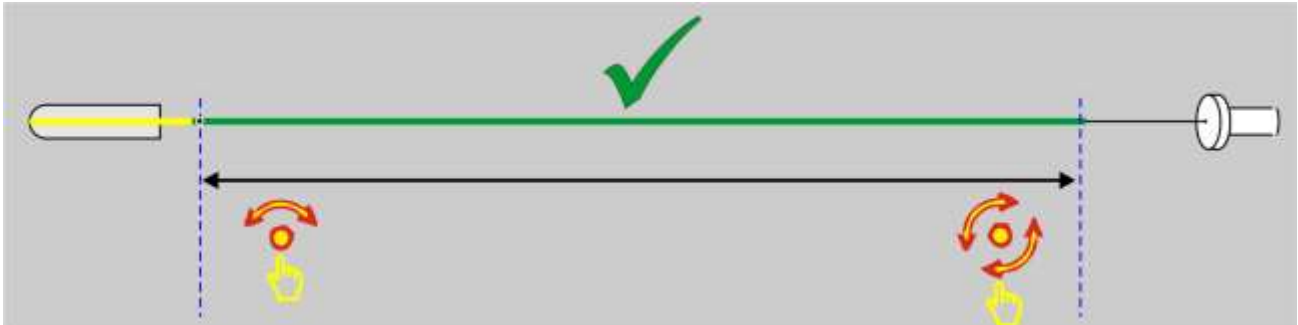
Figure 4. Scenario in which the use of the Catheter Bending functionality can be safely used.

Figure 4 shows how the catheter bending functionality can be used safely .