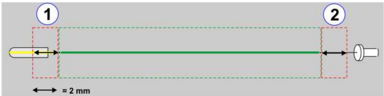
Figure 2. Margins around the reconstructed catheter. Green dashed line indicates the 2 mm margin around the catheter. The erroneous margins are shown as red dashed lines, at the tip end (1) and connector end (2).

Figure 2 shows the erroneous margin around the last catheter reconstruction points at the tip end (1) and connector end (2).