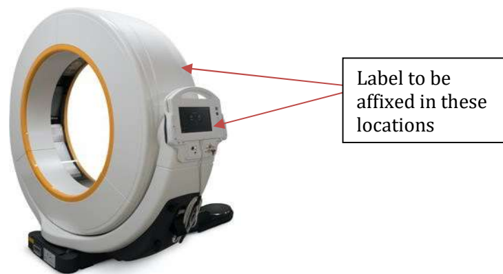
Figure 2- Image depicting location of where labels will be affixed.