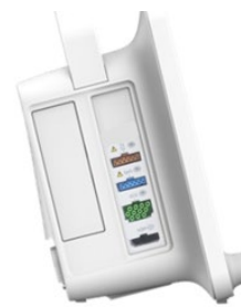
B1x5P without E-module slot option