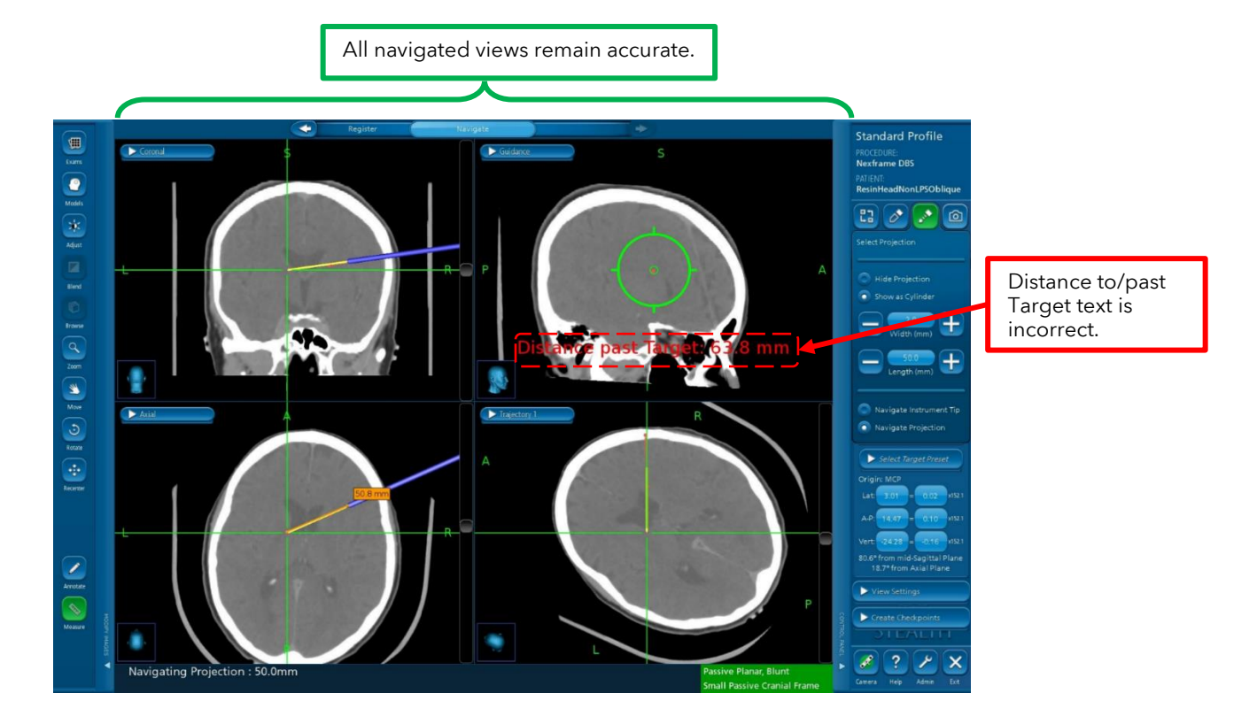
Figure 2 Distance to/past Target Text Inaccuracy seen in Navigate Task of NexFrame™ DBS