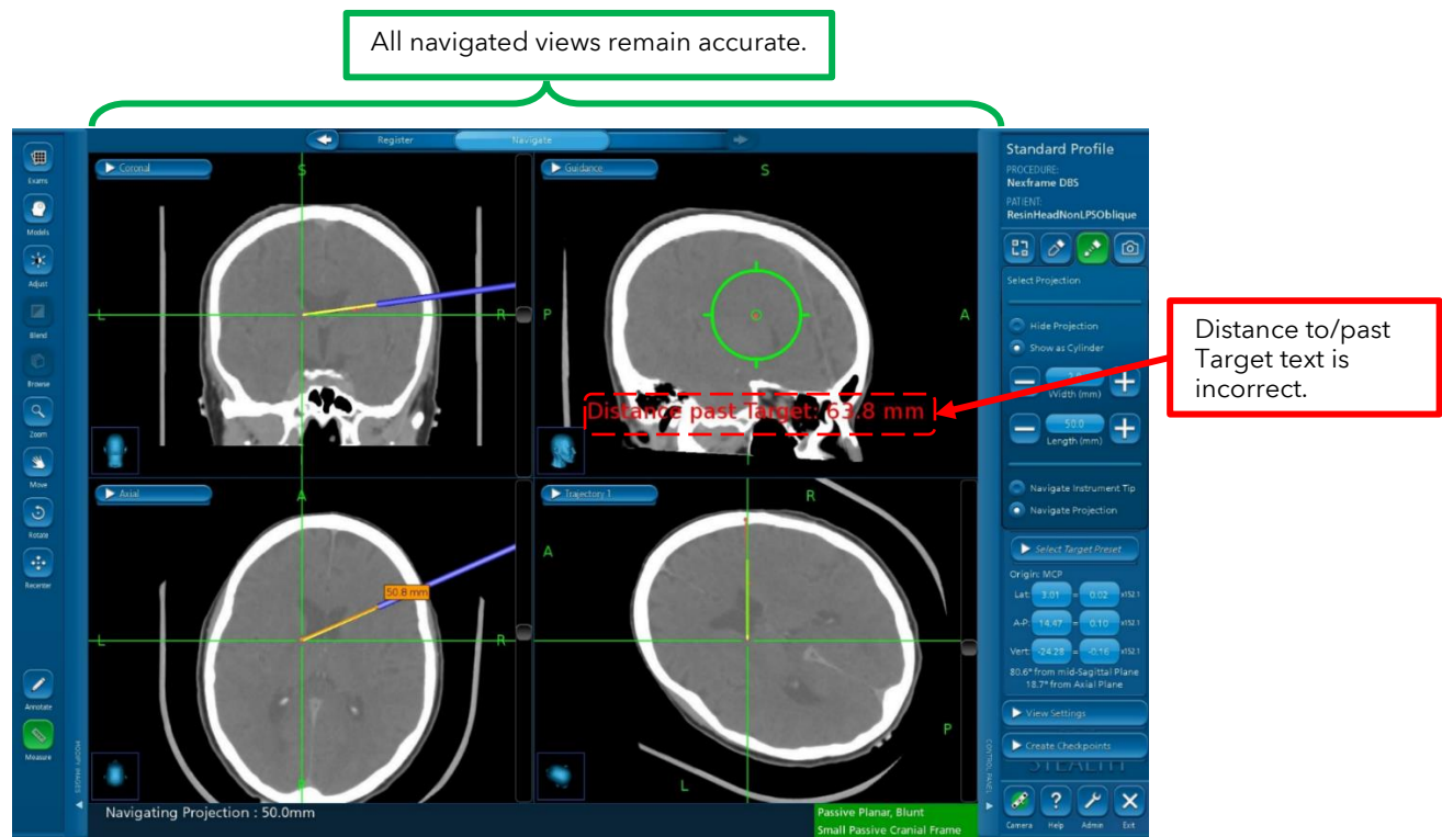
Figure 2 Distance to/past Target Text Inaccuracy seen in Navigate Task of NexFrame™ DBS