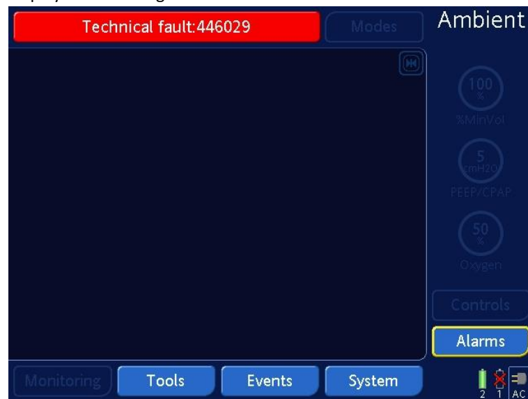
Figure 1: The display indicates “Ambient State”, and a red message with a Technical Fault number (example, a different Technical Fault number might be displayed)

During the “Ambient State” the ventilator will alarm audibly and visually and display the following on the screen: