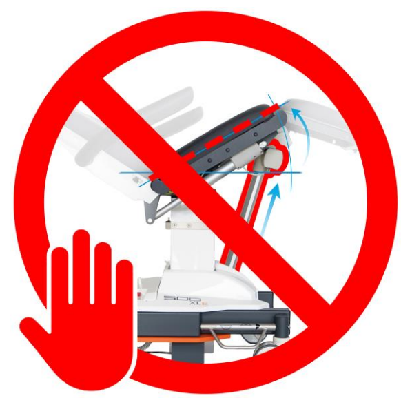
PROHIBITED - Critical patient positions!

PROHIBITED! Tilting of the seat part by extending the seat part drive is prohibited. Memory positions that have been saved must be adjusted