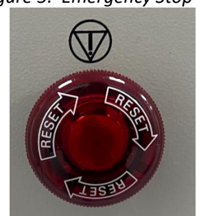
Figure 5. Emergency Stop