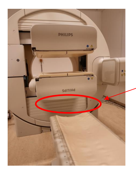
Figure 1. Image of gap between the patient support and detector

Gap between the detector and patient support. During PPM, the gap may decrease creating the potential for extremity entrapment.