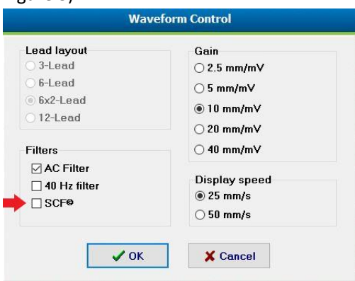
Figure 3 Waveform Control window

It can also be enabled/disabled by left-clicking anywhere in the real-time ECG window which opens a "Waveform Control" window, allowing the user to set displayed ECG leads, filters (including the SCF), display gain and display speed (see Figure 3).