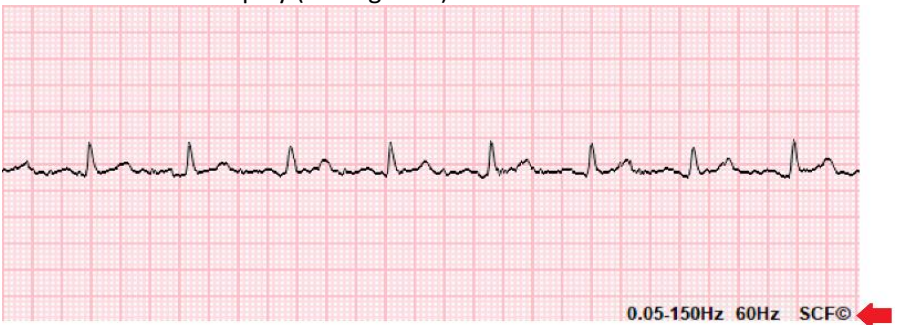
Figure 4 Real-time ECG Display

When the filter is on, the "SCF©" mark appears in the lower right-hand border of the real-time ECG display (see Figure 4).