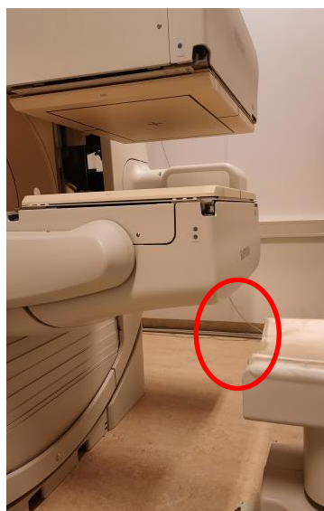
Figure 2. Side Image of gap between the patient support and detector

Philips has received one (1) report of an adverse event associated with this issue. In this reported event, the operator positioned a patient on the patient support and initiated the total body Pre-Programmed Motion (PPM). While the patient support and detectors were in motion, the patient straightened their leg due to a cramp, causing their foot to extend and become entrapped between the patient support and the detector. The patient sustained a foot fracture.