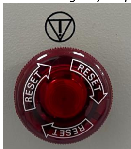
Figure 5. Emergency Stop