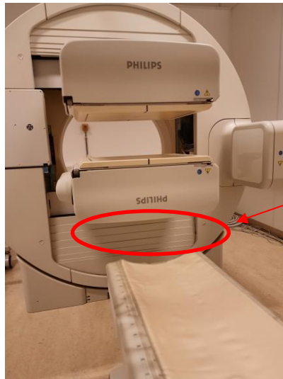
Figure 1. Image of gap between the patient support and detector

Gap between the detector and patient support. During PPM, the gap may decrease creating the potential for extremity entrapment.