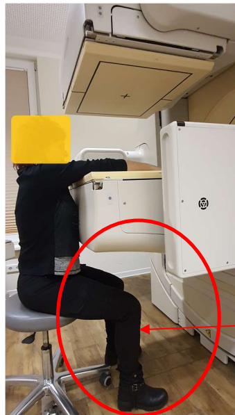
Figure 3. Avoid positioning a patient's lower limbs under the detector below Center of Gantry

Do not position a patient's lower limbs under the lower detector