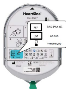
Figure 2 – Pad-Pak Expiry