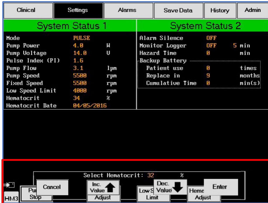
Figure 1 – Example of Atypical Screen Behavior, Overlapping Buttons