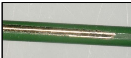
Figure 3: PTFE damage on the Synchro Guidewire