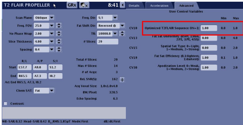
Figure 4. Optimized T2 FLAIR Sequence enabled (set to 1.00) in the Advanced Tab for T2 FLAIR Propeller