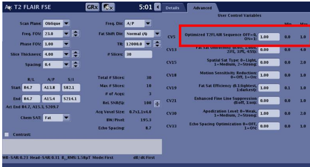
Figure 3. Optimized T2 FLAIR Sequence enabled (set to 1.00) in the Advanced Tab for T2 FLAIR FSE