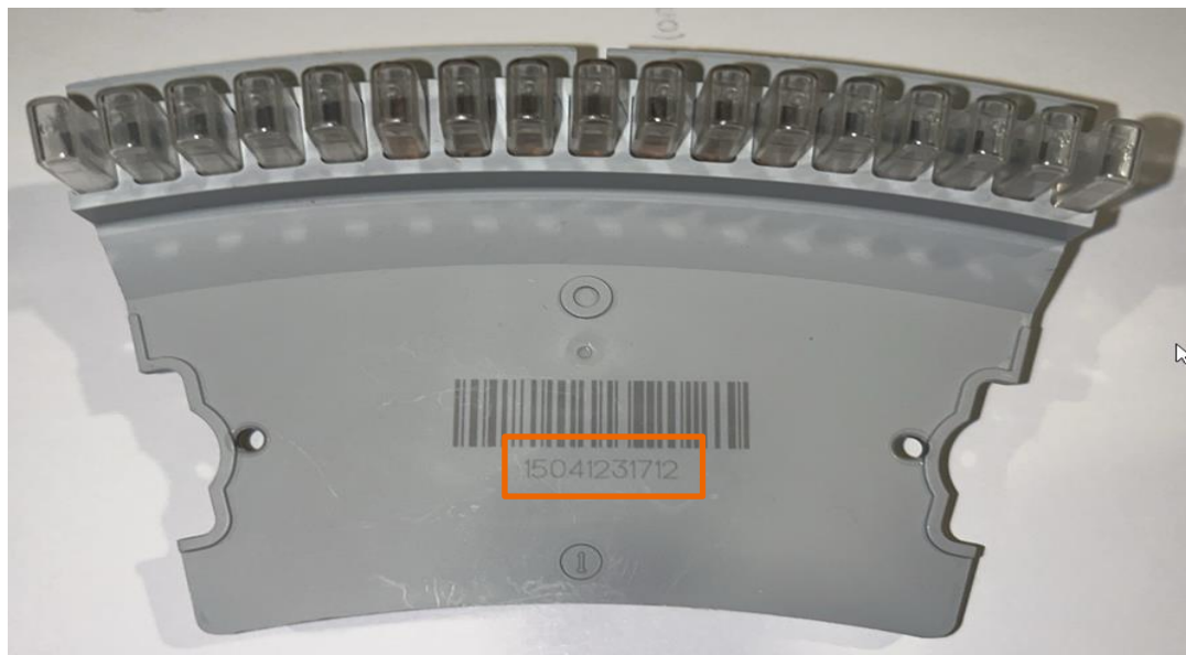
Figure 1. Location of the lot number on Atellica CH Reaction Ring Cuvette Segment

1. Enter diagnostic state ( Enter Diagnostics State in Atellica CH per Section 18 Troubleshooting of the Atellica Solutions Operator Diagnostics Online Help).